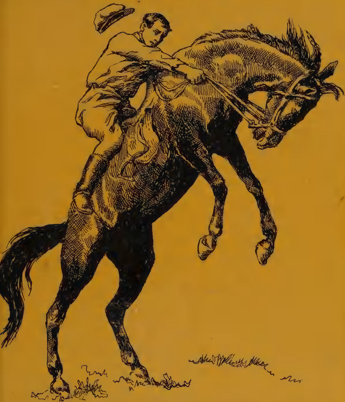
After a terrible struggle I threw him off backwards